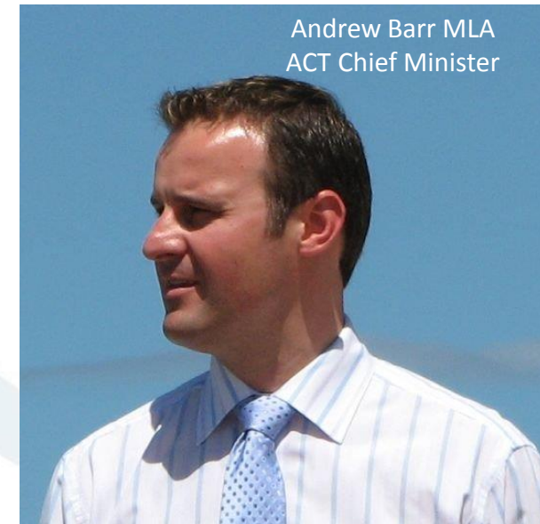
Andrew Barr MLA ACT Chief Minister