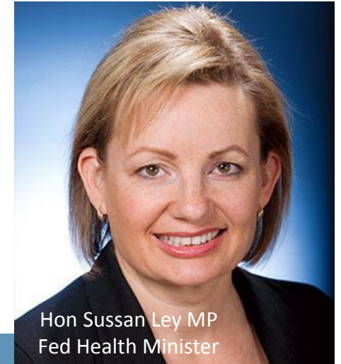
Hon Sussan Ley MP Fed Health Minister